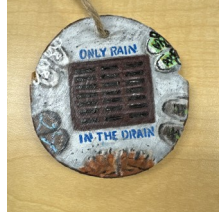
NYWEA Tree Ornament