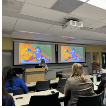
World Toilet Day