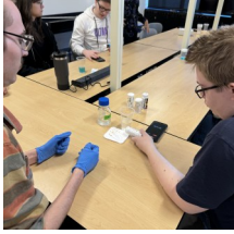
Illicit Discharge Training