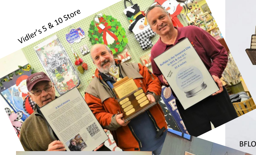
Vidler's 5 & 10 Store