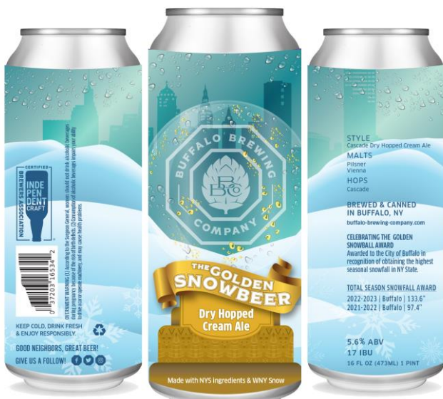
A collectable can!