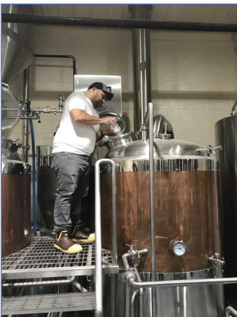
Adding the snow

The Golden Snowball trophy and Golden Snowbeer are more than just about snow. Both recognize that snow has been, and continues to be, very much a part of Buffalo and WNY (engrained in our DNA) – whether one is drawn to its beauty, snow sports, or curse the burdens it brings. It is certainly a Buffalo identifier for folks living outside of WNY. Both the good and bad of snow is what binds our city and region and exemplifies why we are a "City of Good Neighbors". It's a WNY Thing. We live it!