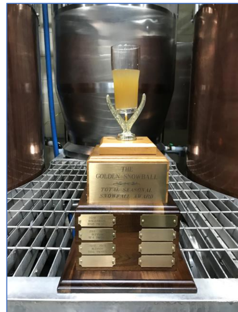
Extracted "wort" – a first look at the quality