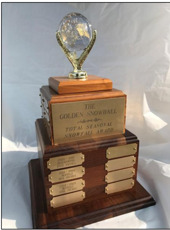
Golden Snowball Trophy