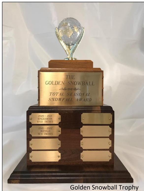
Golden Snowball Trophy