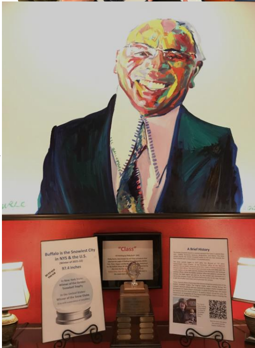
Russell's Steaks, Chops, and More