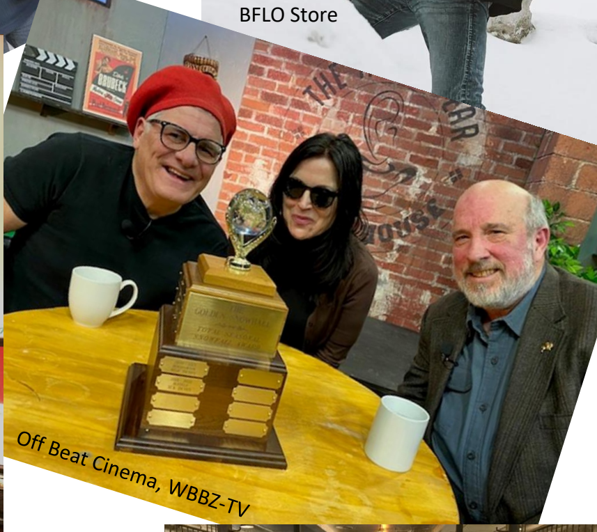
Off Beat Cinema, WBBZ-TV