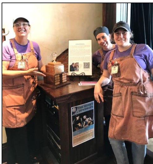
Welcoming the trophy at the Art's Café.