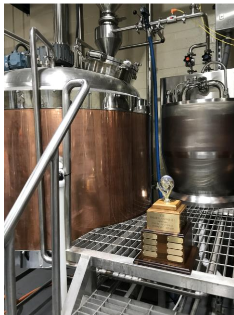
Good mojo from trophy